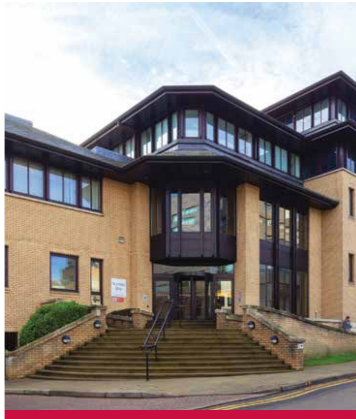
No 1 Legg Street Chelmsford