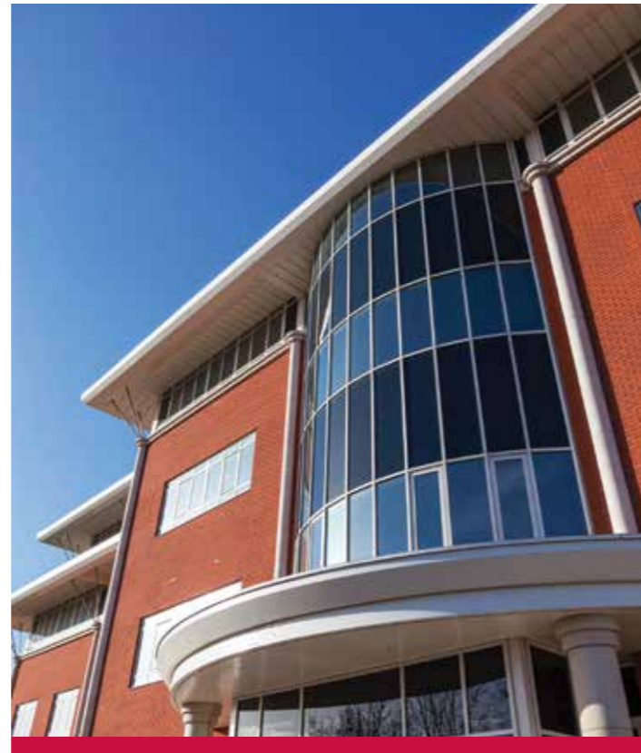
Lakeside House Northampton