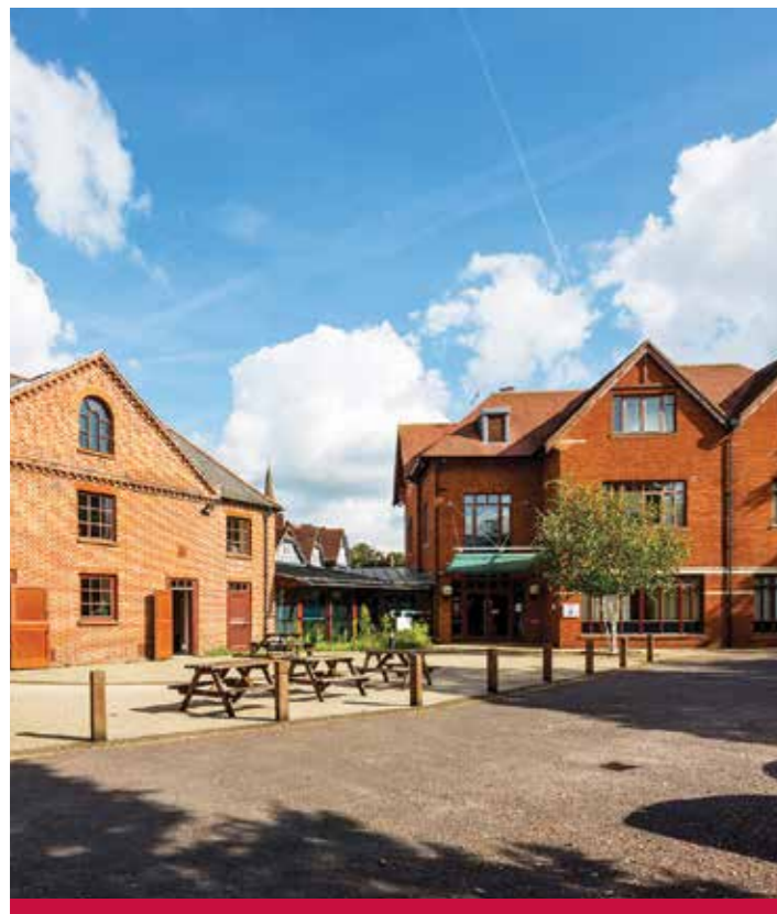
De Ville Court Weybridge