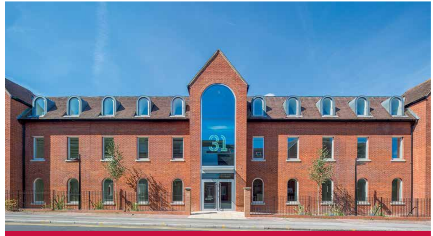
31 Chertsey Street Guildford