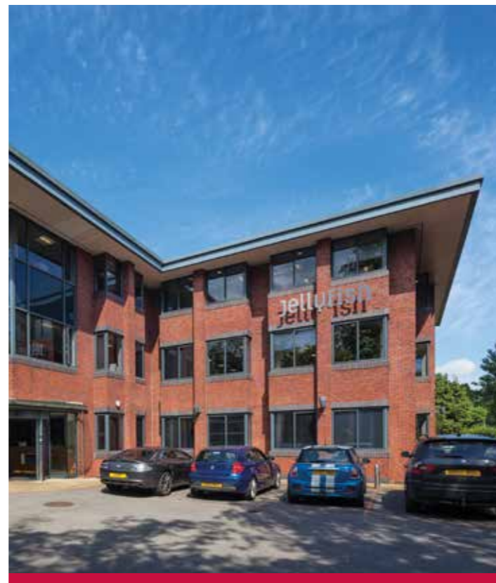
Jellyfish House Reigate