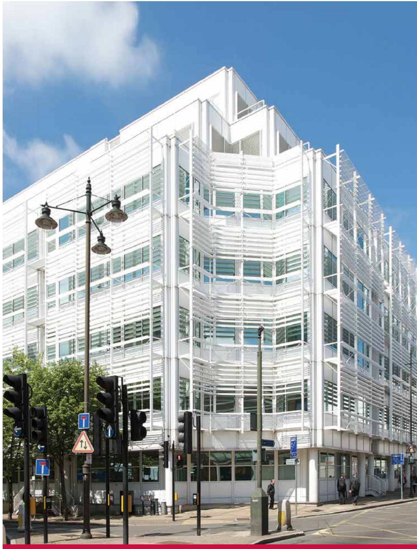
Wimbledon Bridge House Wimbledon