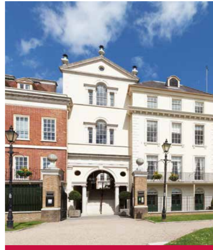
Palm Court Richmond