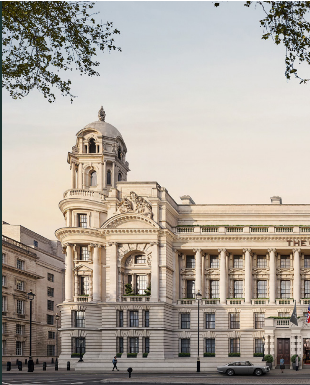
Old War Office, Whitehall, London SW1A 2EU